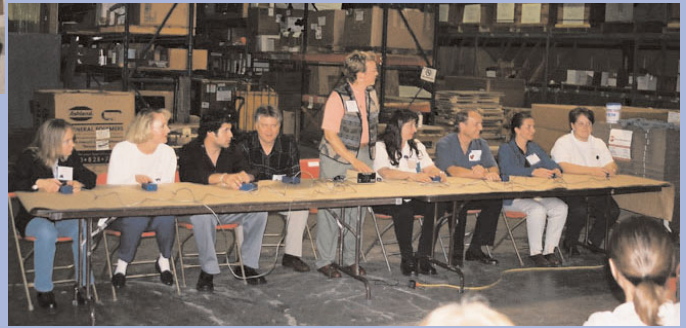
The Quiz Bowl competition got down right ugly!