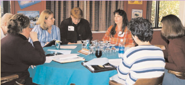
Round Table topics included something for everyone.

D esktop Survival II has been deemed a tremendous success! The 2002 design course was such a hit, that this year's was extended to 1 1/2 days with intense workshops and roundtable discussions. The hot topics in publishing today were covered including using OS X, web software, crossing print with the web, the newest techniques in Photoshop, Illustrator, photo archiving and of course, the Quark vs.