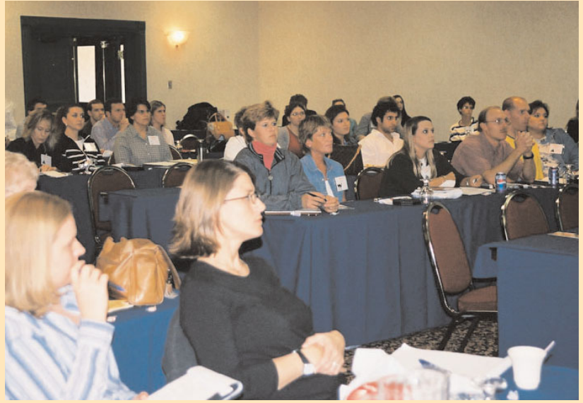
The event was held Oct. 21-22 in Kansas City and included members from eight states.